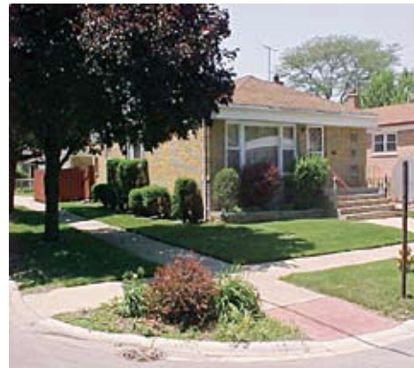
14348 Calhoun Before