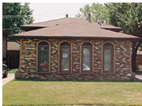
2825 E. 142nd St. Before