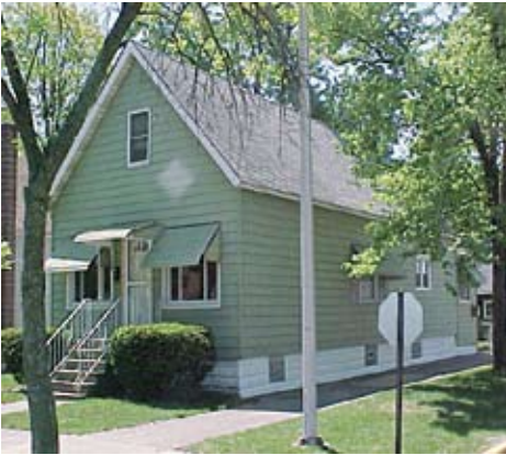
13950 Greenbay Before

Since 2004, NI had been actively pursuing a Best House on the Block Contest® for the Village of Burnham. That goal came to fruition in 2007 as the Village trustees, led by Mayor Polk, approved sponsoring this competition for the entire village. The contest was supported by a large number of local businesses, which gave generous cash contributions.