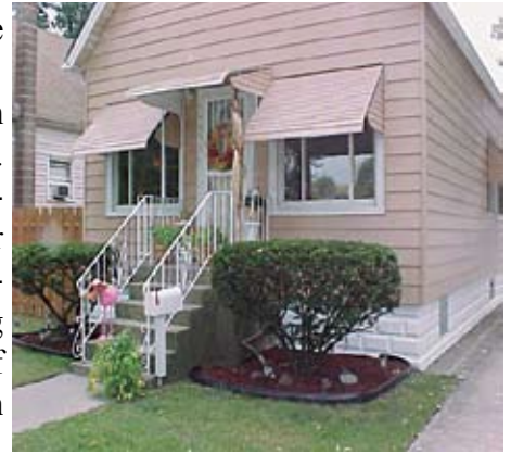
13950 Greenbay After

Interest in the contest was exceptionally high for a community of only 4100 residents. NI received applications from 14 households, almost all of whom completed major renovations to their properties. Improvements ranged from extensive landscaping projects to additions. Over $145,000 of improvements were added to these Burnham residences. According to a followup survey, the Burnham Best House on the Block Con-