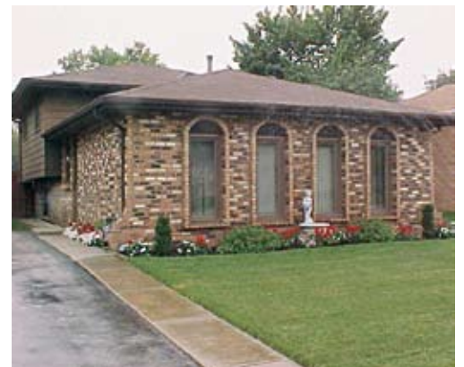
2825 E. 142nd St. After

These businesses are truly good neighbors to the Village of Burnham.