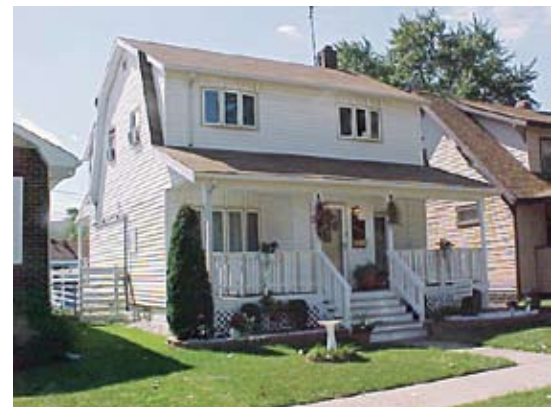
405 - 157th Street

All other entrants who successfully completed their projects received $100 and a Certificate of Participation. Thirteen contestants won door prizes donated by the following local businesses: Mantis Dentistry, Doreen's Pizza, Eden's Place Day Spa, Nornat Management Services, Illiana Financial Credit Union and Zoom Clean Car Wash.