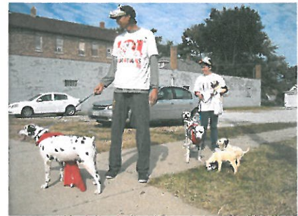
Working towards 101 dalmatians.